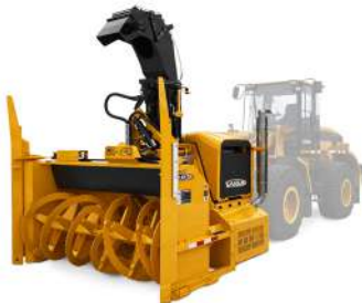
D25 | D35 | D45 | D55 | D65