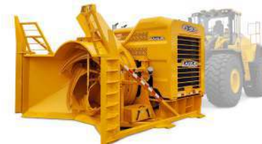
D87 | D97