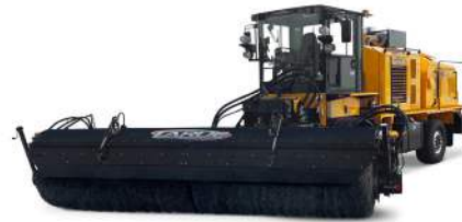
FB18 | FB20 | FB22