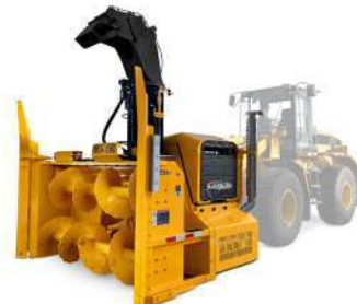
D30 | D40 | D50 | D60