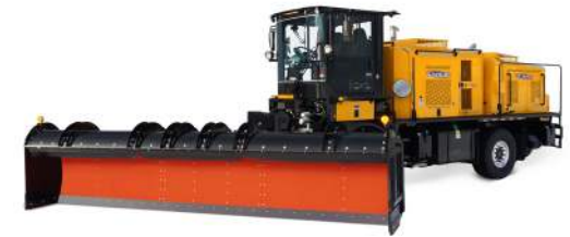
FP18 | FP20 | FP22