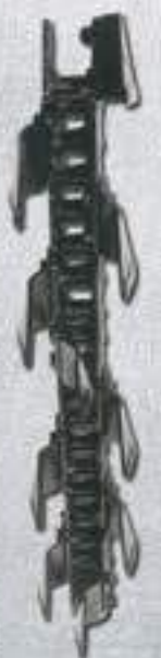
Double Standard Anti Back Flex Recommended for harder, drier soil, roughly twice the number of teeth.