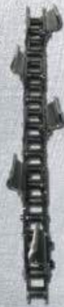
Standard Recommended for loose, damp soil conditions.

Demand the best and most durable trenching attachments for today and tomorrow...LOWE®