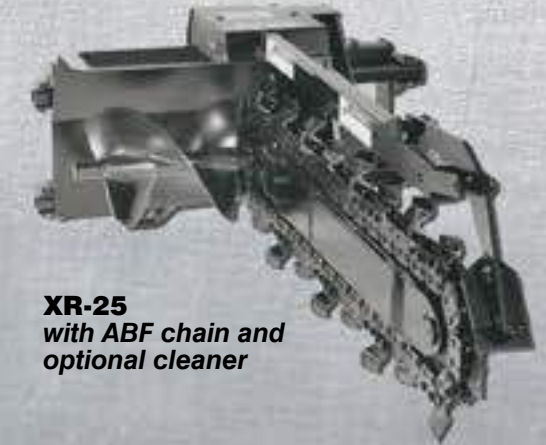
XR-25 with ABF chain and optional cleaner