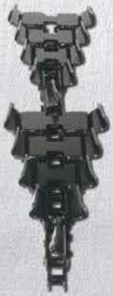
Expanded Double Standard Anti Back Flex Recommended for loose soils when extra width is required.