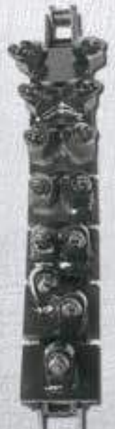
Rock & Frost Anti Back Flex Recommended for frost and rocky conditions.