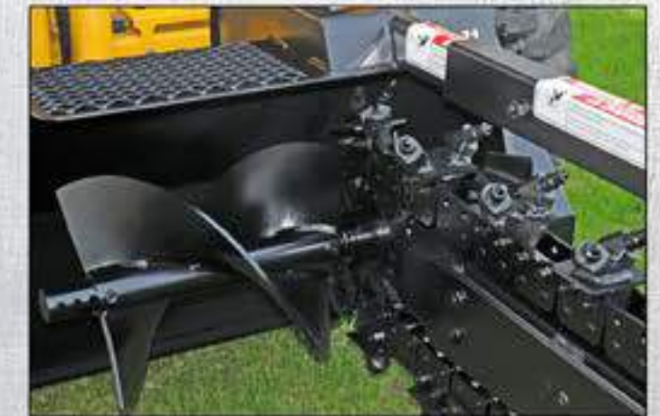
Designed for the toughest jobs.