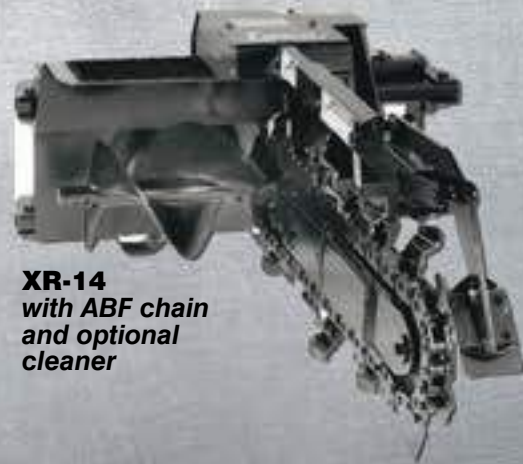
XR-14 with ABF chain and optional cleaner