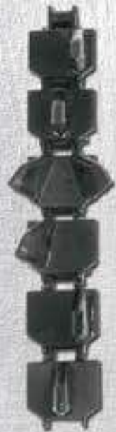
Terminator Recommended for hard, dry digging conditions and rock. 5 & 6 inch (127 & 152 mm) trench widths are available.

Also, remember to check out our full line of auger and grapple attachments.