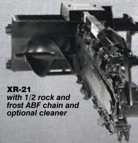
XR-21 with 1/2 rock and frost ABF chain and optional cleaner