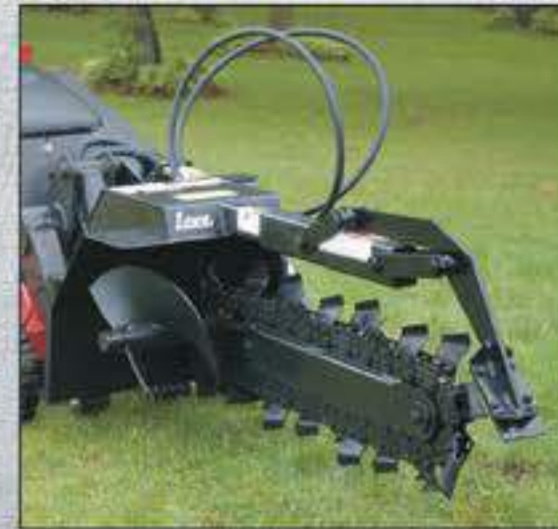
The XR-7 is ideal for the newest mini-loaders.