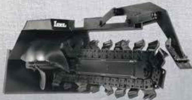
XR-7 with ABF chain and optional cleaner