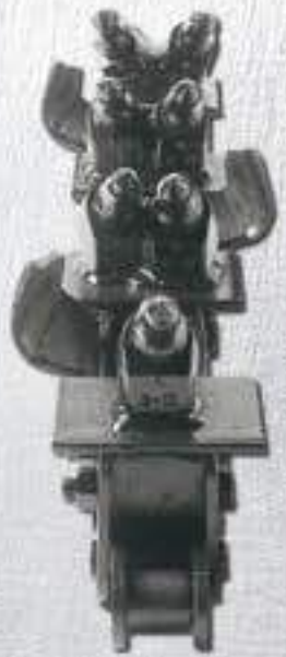
1/2 Rock & Frost Anti Back Flex Recommended for harder soil and mixed rocky digging conditions.